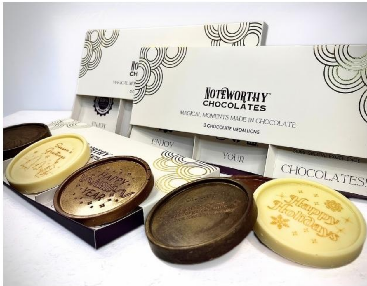
3 Medallion Gift Box 2024